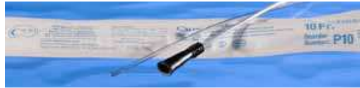
Sterile catheters are packaged individually for single use.